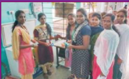
SOKA AAVIN PARLOR