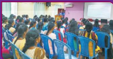
SPECIAL NEED CELL