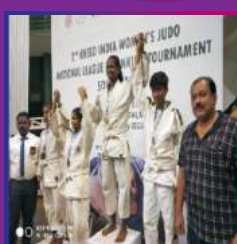
Ten Students - Khelo India & National Level Tournaments.