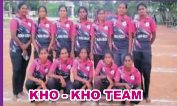
KHO - KHO TEAM

Football and kho-kho - 3 rd position in Madras University B-Zone Tournaments.