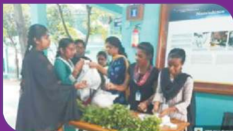
ORGANIC RETAIL OUTLET